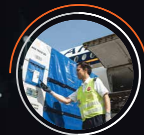
Cargo Handled (Tonnes)*