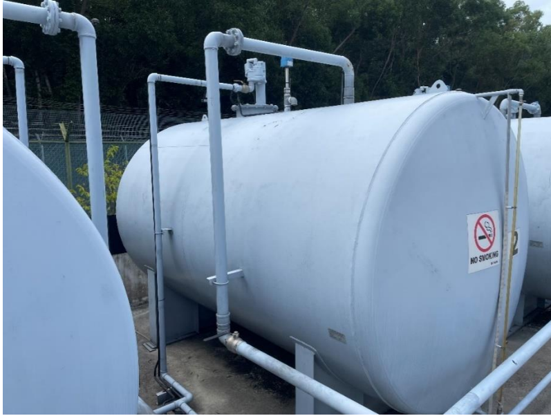
Figure 3 SMC main tanks