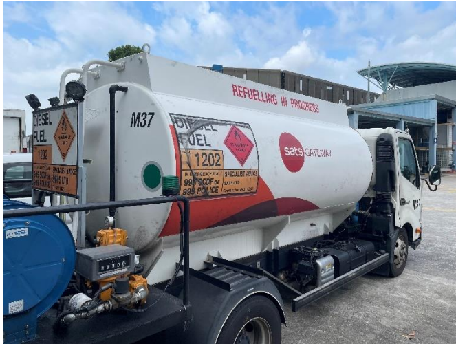
Figure 1 Bowser