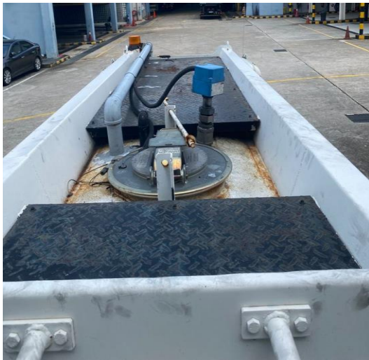
Figure 2 Bowser tank