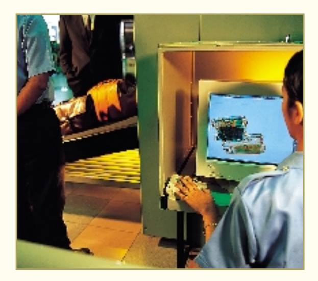
Our reputation as a regional specialist in the aviation security industry has earned us recognition and awards.