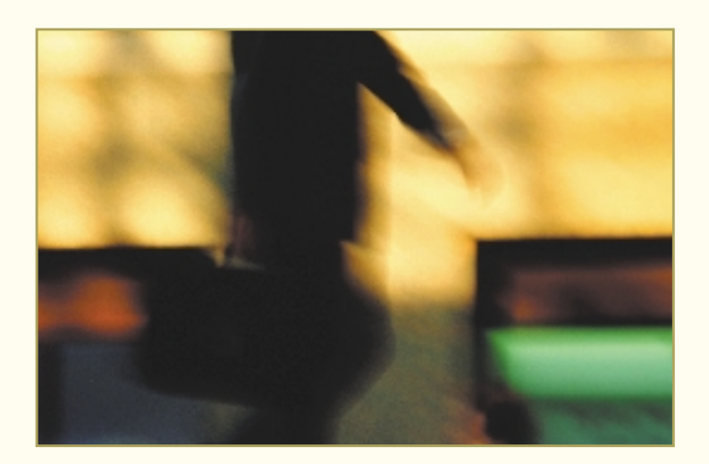
SATS has always stressed the importance of providing exceptional customer service in all areas of its business.