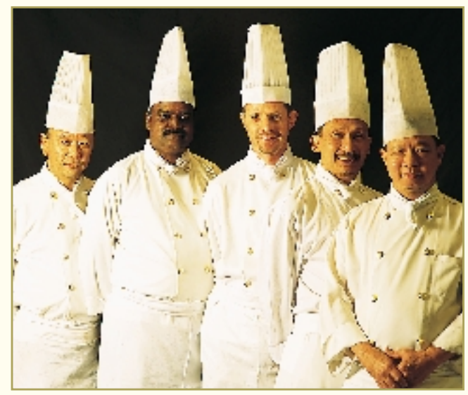
Chefs with the midas touch... attending to every detail of meal preparation.