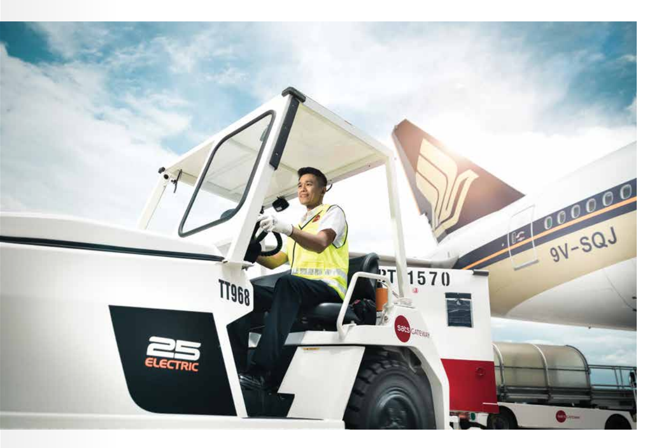
By 2020, we aim to convert 59% of our diesel ground support equipment (GSE) to electric ones.